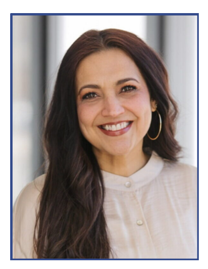
Generously Sponsored by: